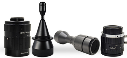
Macro Lens Industrial Lens