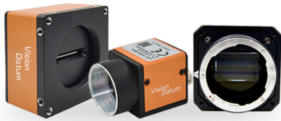
SWIR/LWIR Camera Industrial Camera