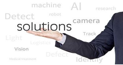
System Solution No-programming Software

Hangzhou Vision Datum Technology Co., Ltd.