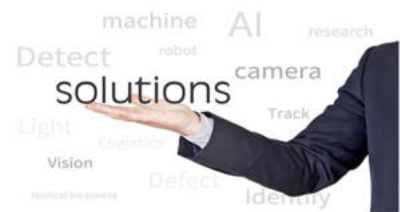
System Solution No-programming Software