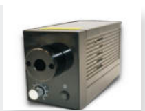
Spot illumination PI Series Fiber LED Lights Source Unit CO Series