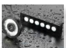
Telecentric illumination CLW-LIT Series UV/IR/Waterproof/Corrosion Resistant illumination

More OEM/ODM Led illumination available, and please contact your sales engineer for projects confirmation.