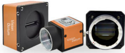
SWIR Camera Industrial Camera