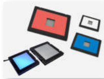
Bottom Flat Backlights illumination BF/BFP Series Side Flat Backlights illumination BFC/BFCP/BFCK Series