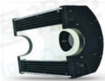
Dome illumination DM Series Tunnel shadowless illumination T Series