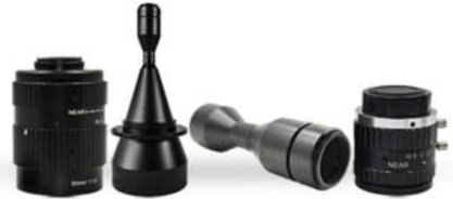
Macro Lens Industrial Lens