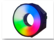
Spot illumination PI Series Three-color illumination AOI Series